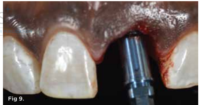
Fig 4. Preoperative periapical radiograph of tooth No. 9. Fig 5. The supracrestal gingival complex around the tooth was severed with sharp dissection and root removal in a flapless manner. Fig 6. The 12-degree co-axis implant feature requires aligning the long axis of the drill shank toward the incisal edge of the adjacent teeth as a point of reference for osteotomy making. Solid extended shank drills were used to eliminate chattering and vibration during this process, leading to precise site preparation. Because only the apical one-half of the implant was being used for primary stability, this procedure must be performed accurately. Fig 7. Inverted body-shift design implant with subcrestal angle correction of 12 degrees was premounted to the implant insertion device that counter-matched the angle offset (-12 degrees) to allow the implant to spin true at zero degrees. The prosthetic screw-access hole was on the direct lingual aspect of the implant mount with an orientation groove on the labial side. Two black lines on the implant mount near the implant-abutment interface denote 3 mm of depth from the abutment connection. Fig 8. The implant was placed into the osteotomy site with an incisal angulation. The thread depth decreases toward the coronal portion and the thread distance or pitch is 0.6 mm, which means that the implant moves apically only 0.6 mm per full revolution. Fig 9. The implant was placed to the second black line from the midfacial free gingival margin designating 3 mm of implant depth and placement to the facial crest of bone. The orientation groove was aligned to the labial aspect with the screw access to the palatal.

of the labial plate was present involving the coronal one-third of the extraction socket. This would be addressed during socket grafting using a cross-linked collagen membrane. The osteotomy was precisely created with the use of extended-length solid shank drills, because only the apical part of the implant was providing primary stability. The incisal edge position was used as a point of reference when drilling the osteotomy and during placement (Figure 6).